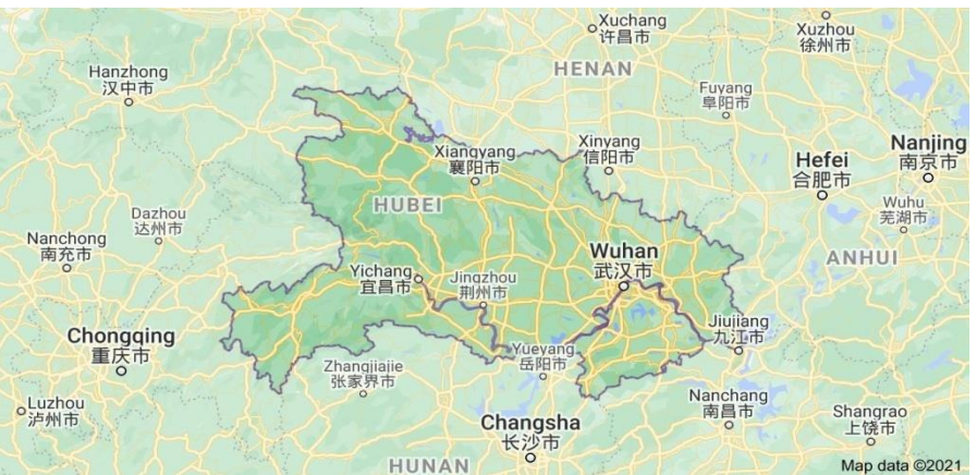
Fig.2: The Map of Hubei Province in Midland China