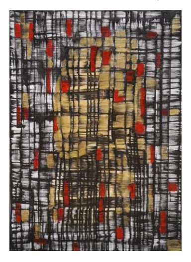
Fig. 10. Daniela Grubisic, Squares Expression I, 2024, Shanghai Art Collection Museu