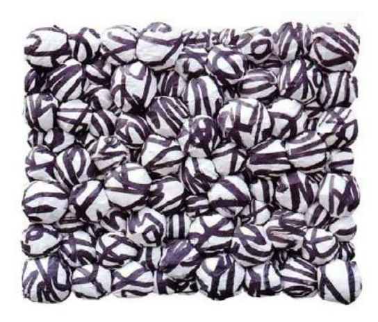
Fig. 8. Wang Nanming, Combination: Ball of Characters, ink on paper, 120 cm x 100 cm, 1992, Pusan Metropolitan Art Museum, South Korea