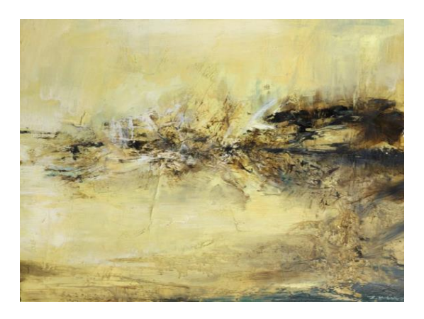
Figure 6. Zao Wou-Ki, oil on canvas, 59,5 x 81 cm, 1967, Collection Henry Clay Frick II, New York, US (sold for €1,392,500 on 5 June 2019 in Paris)

Master artist Wou-Ki Zao (Zao Wou-Ki) a Chinese French painter who was one of the very first to make the link between eastern and western art. He was inspirated by nature, something that we cannot see but something what exist like universe as in abstract expressionism. In painting Stunning Work of nature (Fig. 5) he is using powerful brushstroke and calligraphy to present strong emotions in nature. The range of his techniques (Fig. 6.) is from the vigorous, gestured brushstrokes of America's abstract expressionists to the delicate swirls of Chinese ink paintings. He said that "Everybody is bound by tradition. I am bound by two." Zao Wou-ki is a truly "global" artist, and his appeal stems from globalism thinking.