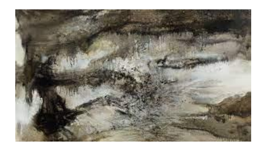
Figure 5. Zao Wou Ki, Stunning Work of nature, brushstroke and calligraphy, 1957, Paris, France