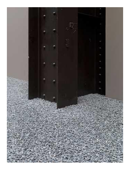
Fig. 9. Ai Weiwei, Sunflower Seeds, 2010, Turbine Hall at Tate Modern