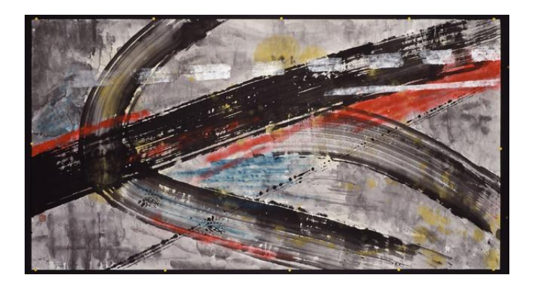
Figure 7. Zhang Lansheng, Free-way No. ∞ 1《自由之路 第 ∞ 1号, ink, acrylic, gouache, rice paper, 195 x 96 cm, 1987, China

He explained that the intersection of poetry and painting attracted him the most: "I think the essence of the two forms of artistic expression is same, in reality. Whether it is brushing on canvas or writing on paper, they are both expressions of the breath of life. They can reveal the hidden meanings without the actual form, reveal the hidden meanings of the universe..." We can easily connect with Shitao way of looking nature and place man in Nature. Painting of nature was big traditional way of thinking that China is connect with nature and showing that through painting in expressive way such as calligraphy, abstract painting, abstract expressionism. In other side we can see this connection with Jackson Pollock as he connects space that surround him in move of showing this connection with himself as connection of China paintings with nature. That all is part of universes consciousness and unconscious. It is about feeling emotions, piece of mind, relaxation liberation of consciousness and subconscious as part of art acting for innovations and changing of view.